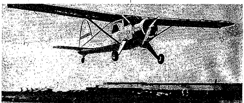
IN FLIGHT, the Beaver, built by de Havilland, is shown here. It was made specifically for backwoods flying and is replete with features to meet north country conditions. Pilot visibility is practically unlimited. It has 1,000 to 1,200 pounds payload capacity